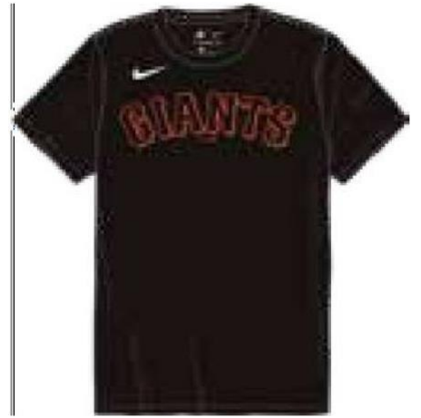
San Francisco Giants N223-00A-GIA-J74 NY23-00A-G IA-J74 N199-00A-GIA-J81 NY28-00A-G IA-J81 Black