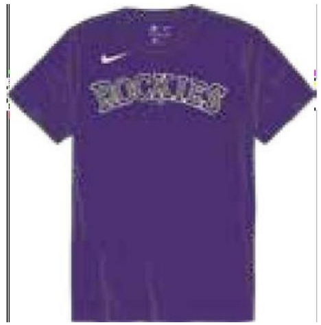
Colorado Rockies N223-51L-DNV-J74 NY23-51 L-DNV-J74 N199-51L-DNV-J81 NY28-51 L-DNV-J81 Court Purple