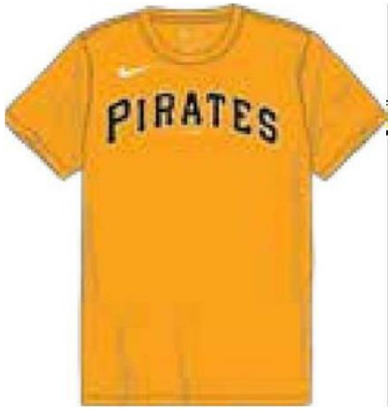
Pittsburgh Pirates N223-790-PTB-J74 NY23-790-PTB-J74 N199-790-PTB-J81 NY28-790-PTB-J81 Sundown