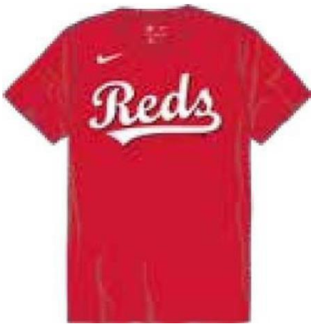
Cincinnati Reds N223-62O-RED-J74 NY23-62O-RED-J74 N 199-62O-RED-J81 NY28-62Q-RED-J81 Sport Red