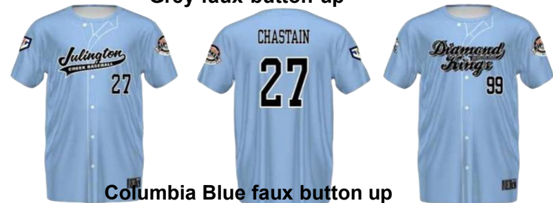
Columbia Blue faux button up