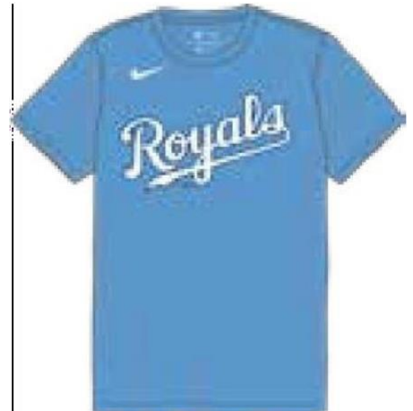
Kansas City N223-4EY-ROY-J74 NY23-4EY-ROY-J74 N199-4EY-ROY-J81 NY28-4EY-ROY-J81 Valor Blue