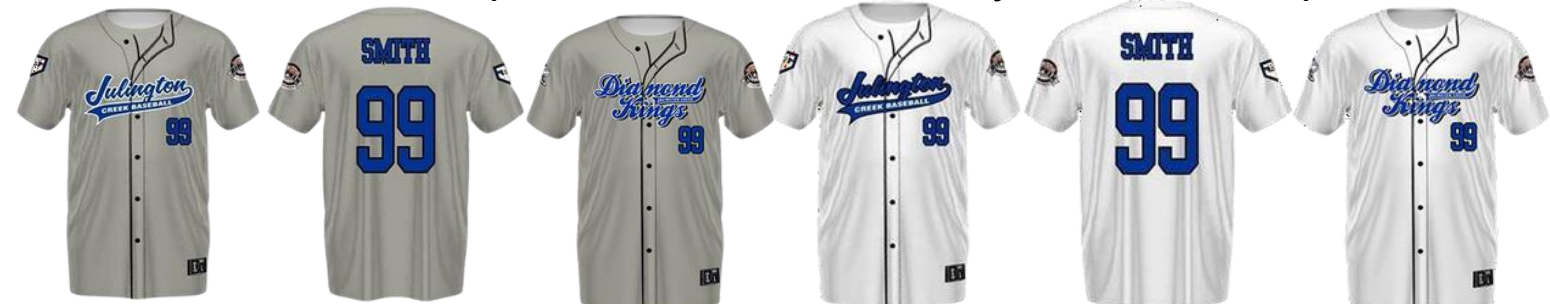
Grey faux button up