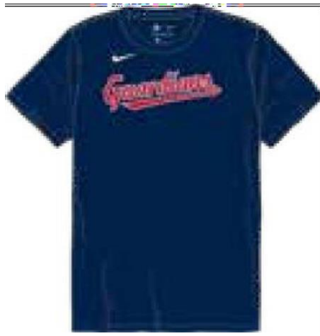
Cleveland Guardians N223-44B-IAN-J74 NY23-44B-IAN-J74 N199-44B-IAN-JB1 NY28-44B-IAN-J81 Midnight Navy