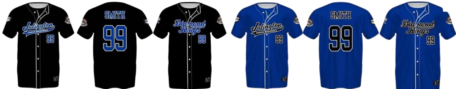
Black faux button up