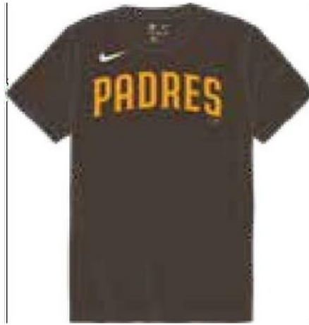
San Diego Padres N223-200-PYP-J74 NY23-200-PYP-J74 N199-200-PYP-J81 NY28-200-PYP-J81 Dark Cinder