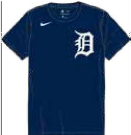
Detroit Tigers N223-44B-DG-J74 NY23-44B-DG-J74 N199-44B-DG-J81 NY28-44B-DG-J81 Midnight Navy